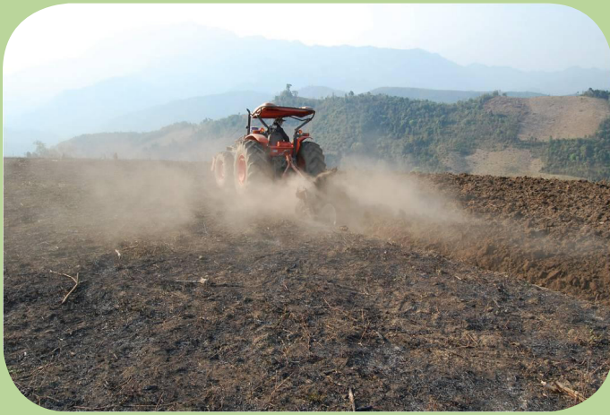
Figure 1: Ploughing in Pakhae Tay village (Feb. 2010)

the district capital, villagers have maintained a traditional Hmong agriculture based on the cultivation of upland rice and traditional maize varieties (with plots slashed and burned and ploughed by hand). Dedicated to the fattening of fighting bulls, improved pastures (based on elephant grass or nia oysan) are also common in the village. While some attempts were made to introduce hybrid maize in 2008, low production and low prices pushed the villagers to revert back to their traditional varieties in 2009.