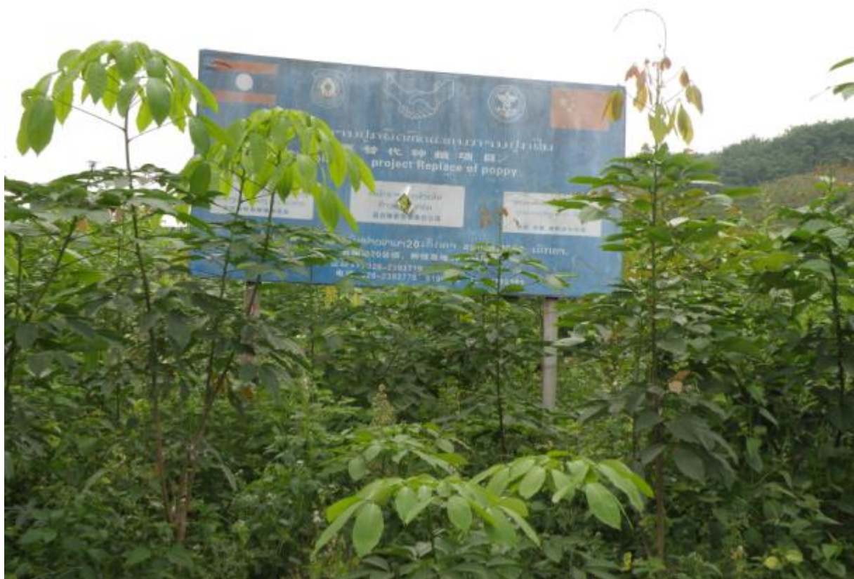
Figure 3 Chinese rubber concession in Nalae District, Luang Namtha Province, Laos. The photo shows young rubber trees ( Hevea brasiliensis ) in the foreground. The sign in the background indicates that the plantation is supported by a bilateral Lao-Chinese cooperation program for the replacement of opium poppy cultivation.

In northern Laos, for instance, several Chinese rubber companies have expanded their operations in Laos under a program subsidized by the Chinese government to alleviate opium poppy cultivation (see Figure 3 below). This move was part of the “Go Out” strategy that made recently privatized state rubber farms from Yunnan eligible for tax exemptions on imported rubber, and for up to 80 percent subsidies on their establishment costs abroad (Mann, 2009). Shi (2008) and Tan (2012) described the cases of the Yunnan State Farms group (a former state and now semi-private rubber enterprise) and the China-Lao Ruifeng Rubber Company (a state-owned company originally specializing in entertainment) which obtained 170,000 ha and 300,000ha respectively of concession and concession-type contract farming schemes in Luang Namtha Province through joint ventures with the Lao military and/or veiled business arrangements with high-ranking Lao officials. As described by the above researchers, the granting of these concessions was negotiated along with several bilateral cooperation agreements during visits of China’s Vice Premier Wu Yi and Premier Wen Jiabao to Laos in 2004.