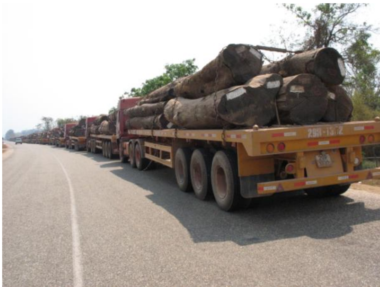
Figure 1 Logs on their way to Vietnam in Khamkeut District, Bolikhamxay Province, Laos

The late 1990s–early 2000s marked an important shift in land and forest governance. Confronted by an enduring lack of financial and human resources and following neo-liberal models advocated by donors like the World Bank and the Asian Development Bank, “turning land into capital” became a key strategy for national development (Lestrelin et al, 2012). Donors expected that facilitating private land investment, granting land concessions, and promoting contract farming arrangements would encourage the private sector to provide innovative technologies and the capital needed to support the modernization and intensification of rural land-uses. Although the policy shift proved an efficient strategy for attracting foreign capital, it had much more ambiguous effects on land and forest governance and rural land development.